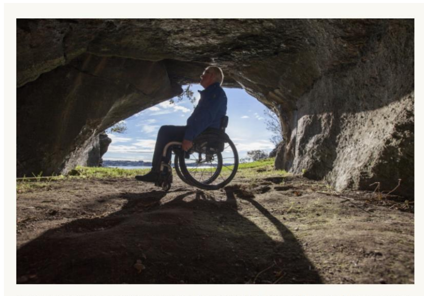
There are many good examples of universal design all around the country. Here from Vistehålå in Randaberg - one of Norway's most famous stone age settlement sites. A wheelchair is no longer a barrier.